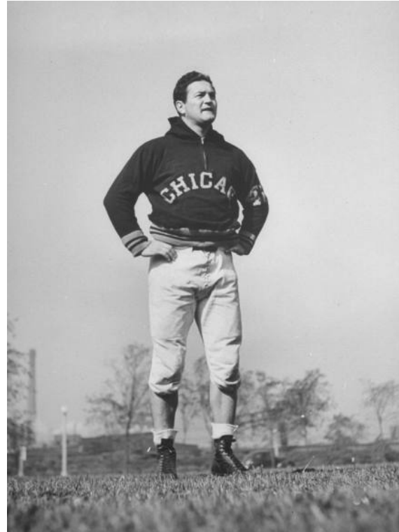
Four time NFL champion quarterback (during his 12 seasons with the Bears), Sid Luckman, 1943, Chicago.