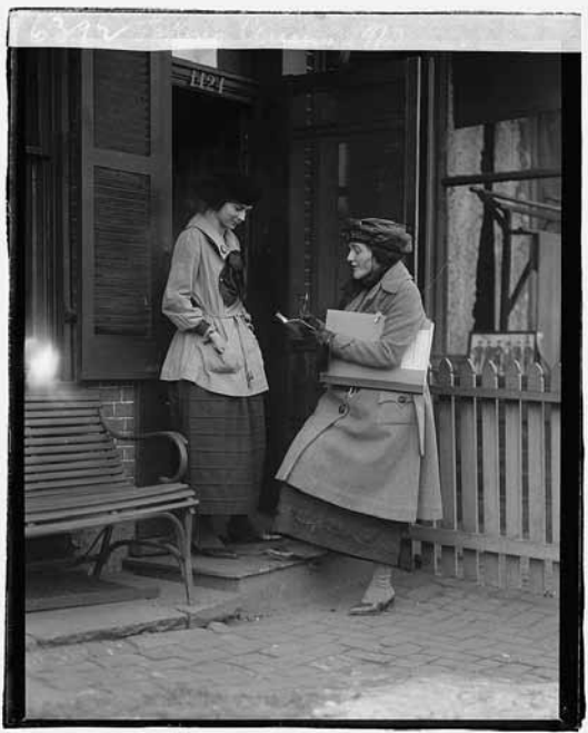
1920 census taker

The results of four different U.S. censuses—from 1910, 1920, 1930, and 1940—are now available to residents of Ravenswood Manor on the RMIA's web site: ravenswoodmanor.com/census .