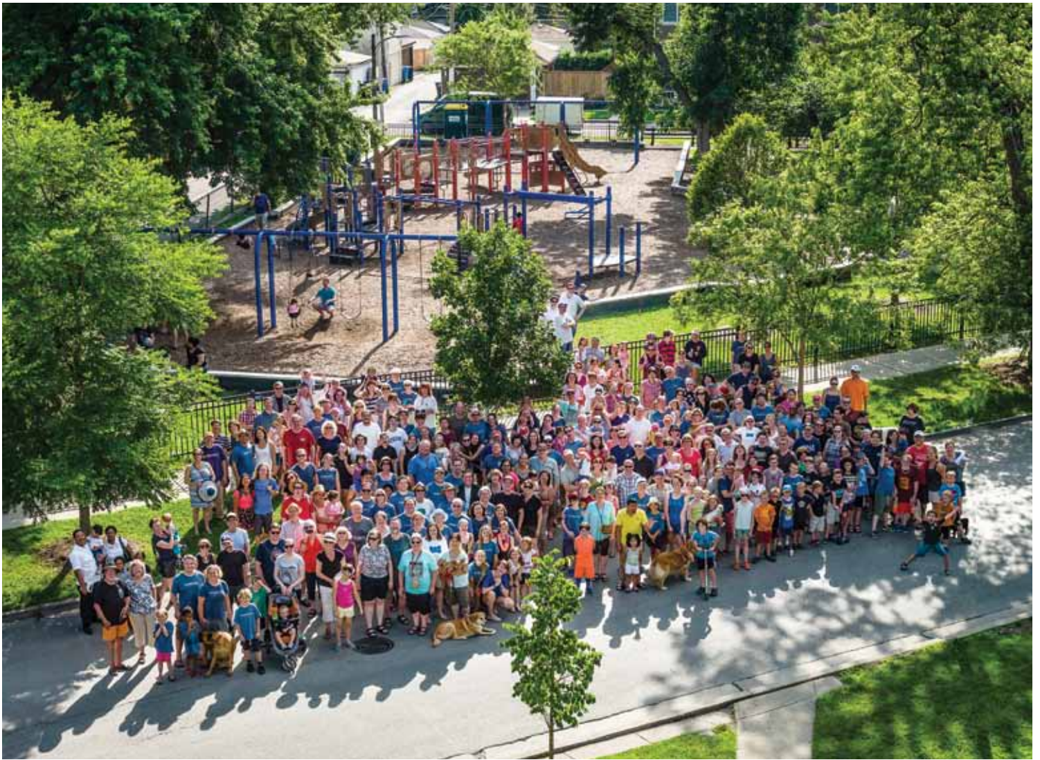
Manor Bash!