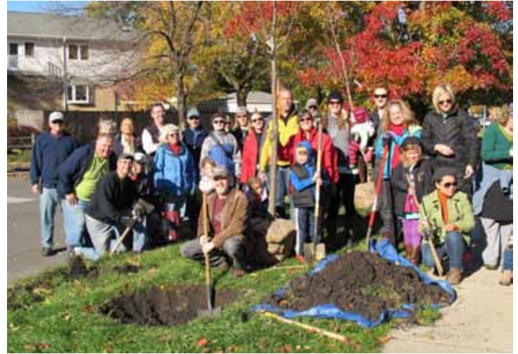
Volunteers plant a tree in the parkway on Manor.

Good news for bringing more trees back to our neighborhood. After the success of last year's volunteer effort, RMIA and Manor Garden Club will apply for another tree planting day in partnership with Openlands and our homeowners. Trees planted will be known as Centennial Trees in honor of RMIA's centennial year and will be planted this fall or spring 2015. Plans are in development, but we need to identify a minimum of 20 spots for trees on the parkways as soon as possible. Homeowners commit to help on the tree planting day and to water and weed their tree(s) on their parkway.