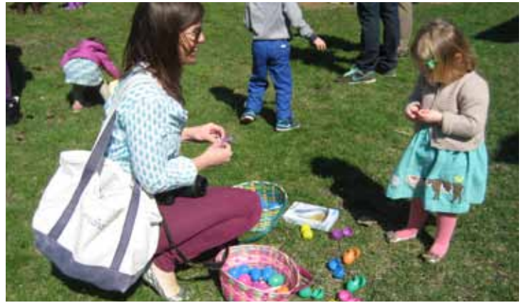
Manor Easter Egg Hunt.

Neighborhood is important, and our’s thrives through residents who find a way to participate. The RMIA depends on volunteers like you to put on our events, keep up communications, and lead through board service. Now is a great time to step forward, join your neighbors, and help out. Here are current volunteer needs. Look for more information on the RMIA website: ravenswoodmanor.com .