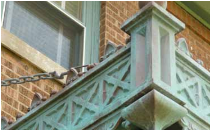
Entrance canopy on Sunnyside.

If you have a detail you'd like to submit for this new feature, please send it to manordetails@gmail.com .