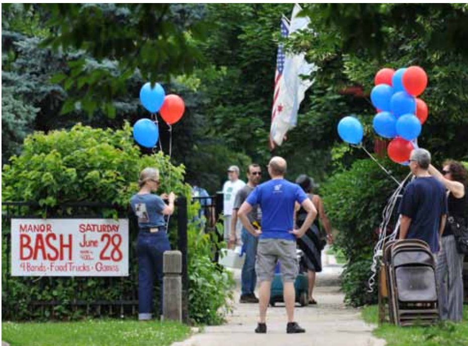
Bash day arrives.