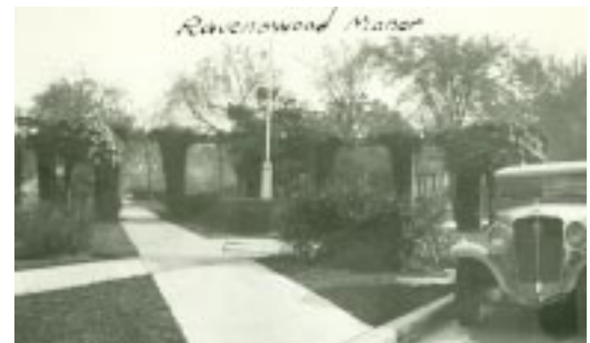
A decorative wood pergola, topped with ivy and flowers, once graced the north end of Manor Park (view looking south from L tracks). It was removed, due to deterioration, in the late 1930s.

To stay up to date on all of the exciting plans for the neighborhood this year, plan on attending the RMIA semi-annual member meeting on Wednesday, October 9 . You can also make sure you're on the Centennial email list: Head over to ravenswoodmanor.com and click on the "Subscribe" tab to add your email to the list. And watch for news about the Centennial on the Ravenswood Manor Facebook page.