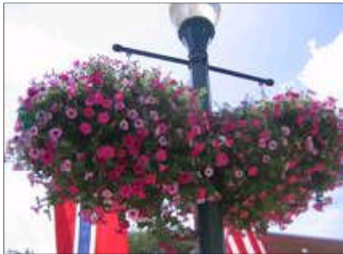
Two hanging flower baskets adorn lamp post in Decorah, Iowa

If you liked the holiday lighted snowflakes that the RMIA bought to decorate our streets, you'll love our vision for the summer! There are beautiful hanging flower baskets on the downtown avenues of Chicago. Imagine flowers in full bloom hanging from the street lights near every intersection. While we can't afford the Michigan Avenue program of flowers, there may be a way to economically run this program ourselves.