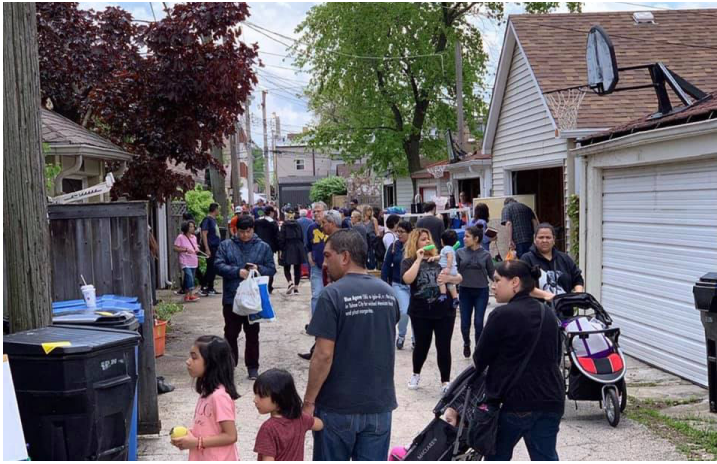
Bargain hunters will soon be pounding the pavement in the Manor again, looking for deals at the Ravenswood Manor Garage Sale.

3) Bulk permit process: RMIA will submit all registrations together to the 33rd Ward office for a bulk permit. Therefore, you must register by the Wednesday, September 1 deadline. Copies of the bulk permit will be emailed to each participant, and you should display it on the day of the garage sale.