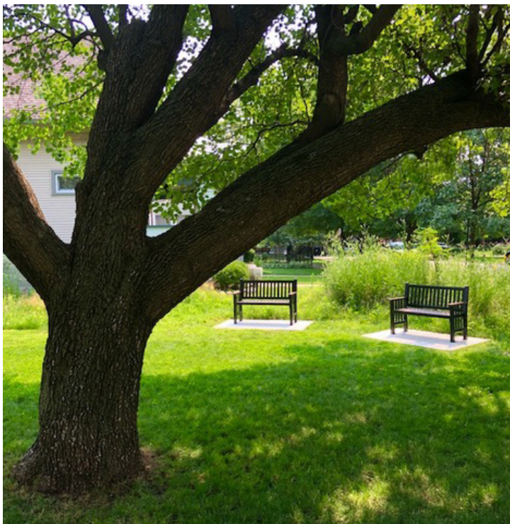
LaPointe Park's improved landscaping has beautified the neighborhood, and its benches are a nice perch during strolls.