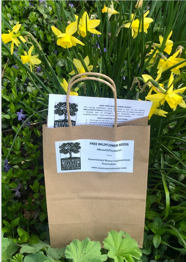
Bags of wildflower seeds are up for grabs for Manor residents, available through an online form or at various popups. Planting instructions are included.