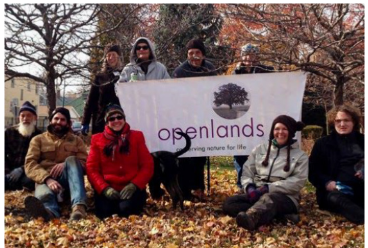
Openlands, a regional environmental conservation group, is partnering with the RMIA for a tree-planting initiative.