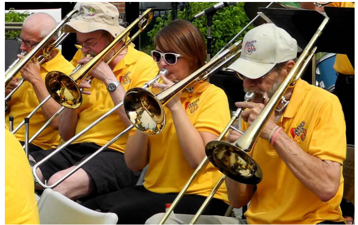
Members of the Horner Park Jazz Band perform at a past concert in the park.