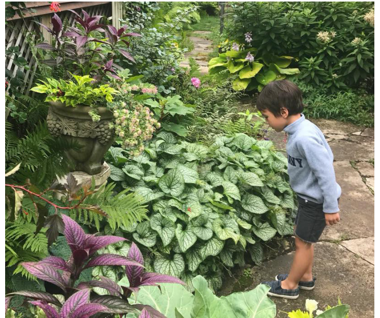
A young gardening enthusiast investigates foliage for creepy-crawlies during the 2019 Manor Garden Walk.

The garden walk is uniquely "by neighbors and for neighbors", featuring a wide variety of gardens throughout historic Ravenswood Manor. It's always a treat to see the personal green spaces and exclusive gardens created by our neighbors who generously open their yards during this annual event. Last year, due to COVID-19 restrictions, many neighbors participated in a virtual garden walk, with pictures posted on Facebook. The pictures were gorgeous, but nothing beats seeing the beauty of gardens in person!