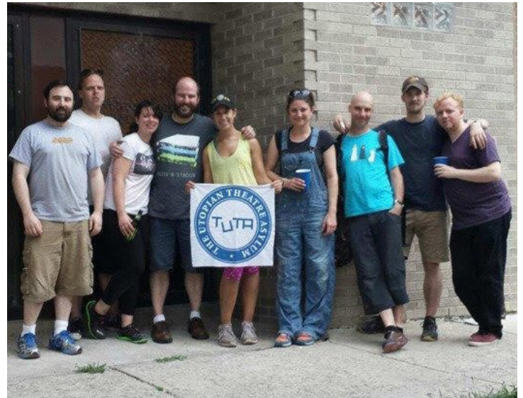
TUTA company members in August 2014 as they moved into the Manor

Manor residents are proud to have such a creative, boundary-pushing artistic entity in their midst. For the last ten years, they have met and