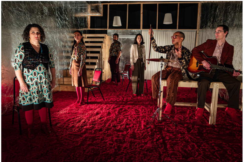
Attempts On Her Life

The Utopian Theatre Asylum – better known to neighbors and audiences as TUTA – recently celebrated the 10-year anniversary of its move into Ravenswood Manor. The theater company marked the milestone with a blockbuster production of the show Attempts On Her Life presented throughout the summer to audiences who filled the cozy space just north of the Brown Line tracks at 4670 North Manor Avenue.